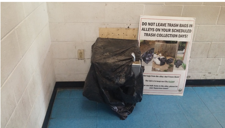
Photograph of inoperable water fountain in the Southeast Quadrant's hallway.