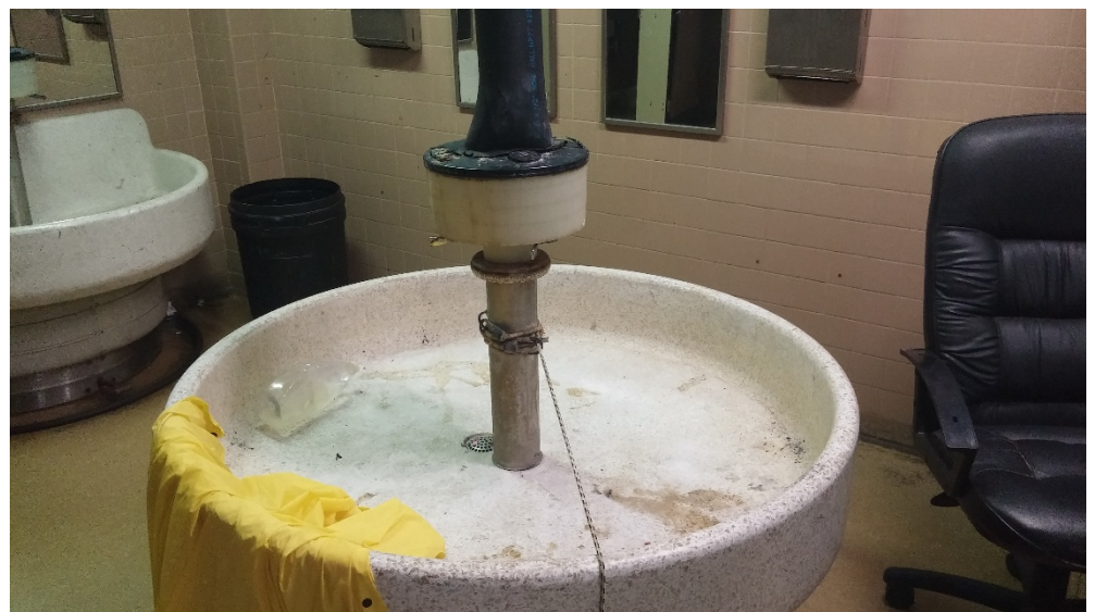
Photograph of inoperable sink in the Southeast Quadrant's locker room.