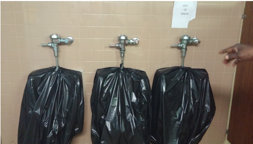
Photograph of inoperable men's urinal in the Southeast Quadrant's locker room.